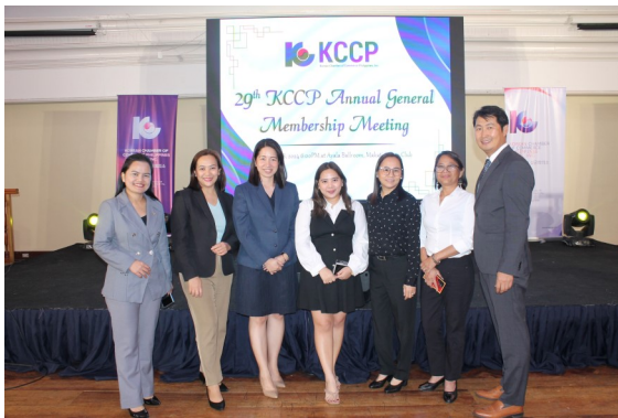
With Members and Guests