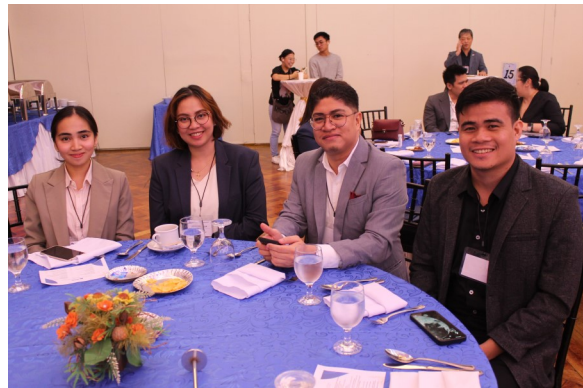
With Members and Guests