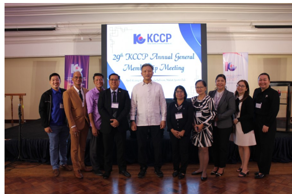
With PHILKOFA Board Members