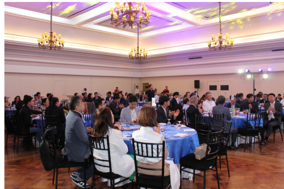
With Members and Guests