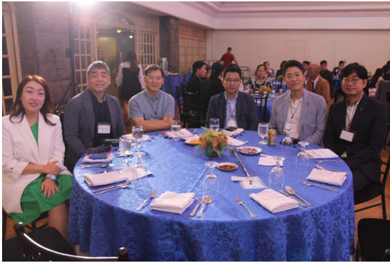
With Members and Guests