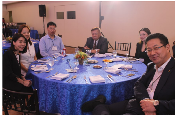
With Members and Guests