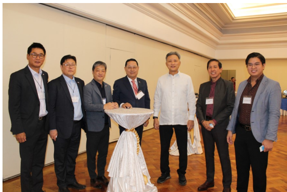
With UKCA Officers and PHILKOREC Members