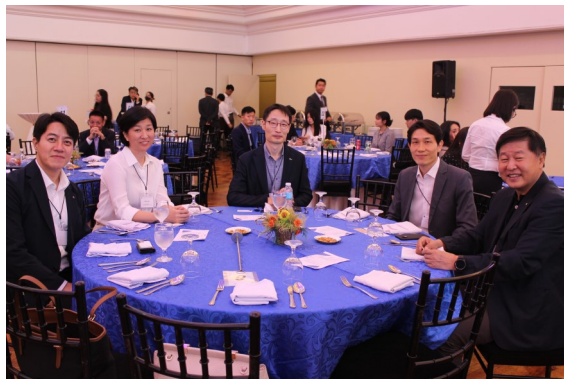
With Members and Guests