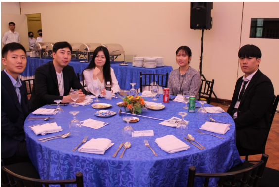
With Members and Guests