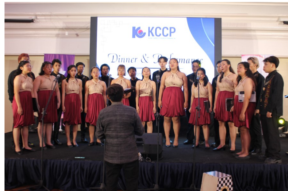
With PUP Bagong Himig Serenata