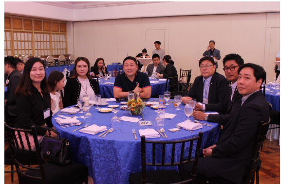
With Members and Guests